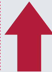
In the past five years, Arkansas's FDI employment...

Since 2010, Arkansas has seen rapid growth in its percentage of jobs supported by global investment.