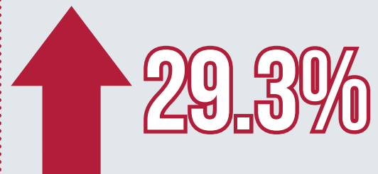
In the past five years, North Carolina's FDI employment...

while the state's overall private-sector employment